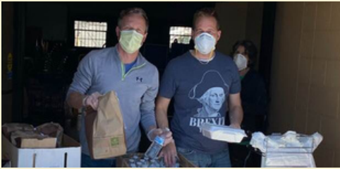
Inside Out: Meal Distribution

A TOTAL OF $237,400 INVESTED IN PHASE I & II