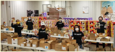
United Way: Book Distribution

INSIDE OUT • LIFESTREAM • SECOND HARVEST CHRISTIAN MINISTRIES • MUNCIE MISSION