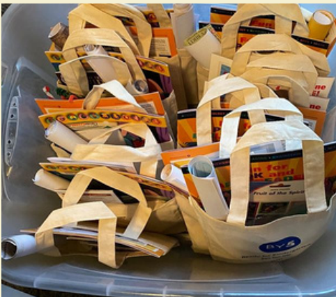
BY5: Learning Packs