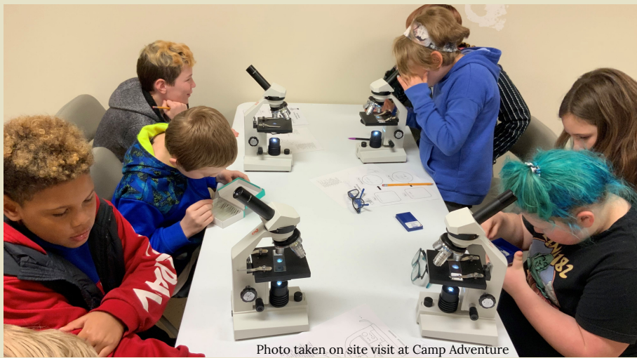
Photo taken on site visit at Camp Adventure